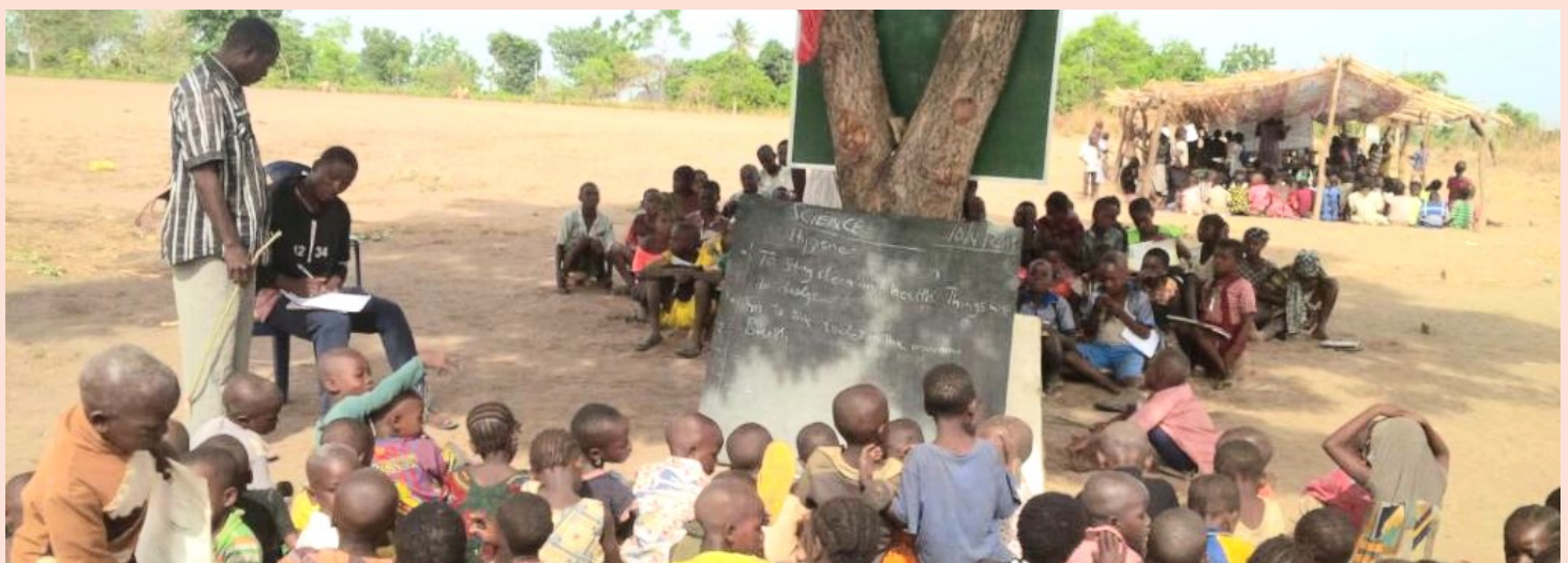
Children having lessons in makeshift classrooms in one of the IDPs camps in Nigeria