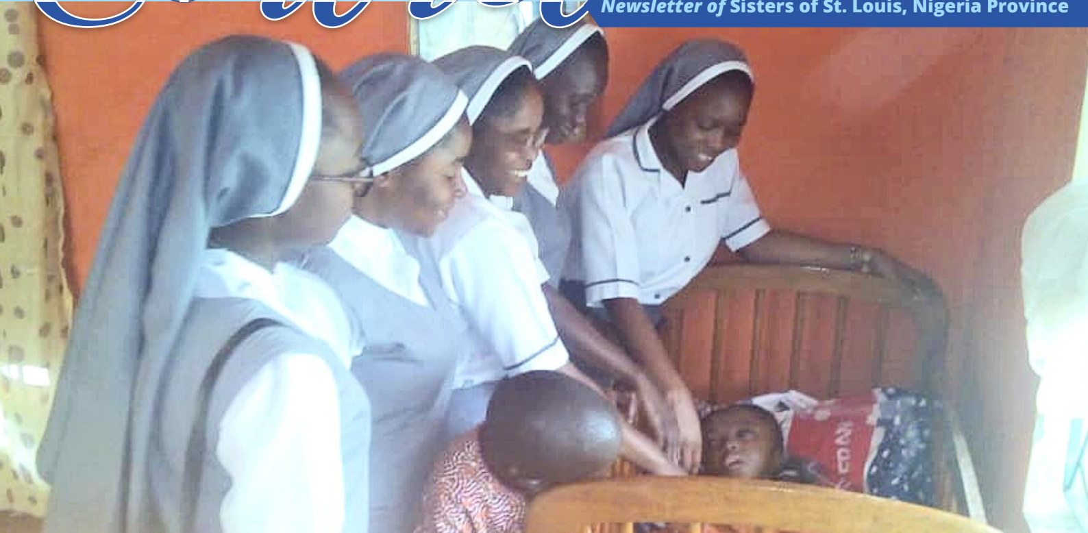
SSL Second Year Novices at the Ibadan Mercy Home in September 2018

Newsletter of Sisters of St. Louis, Nigeria Province